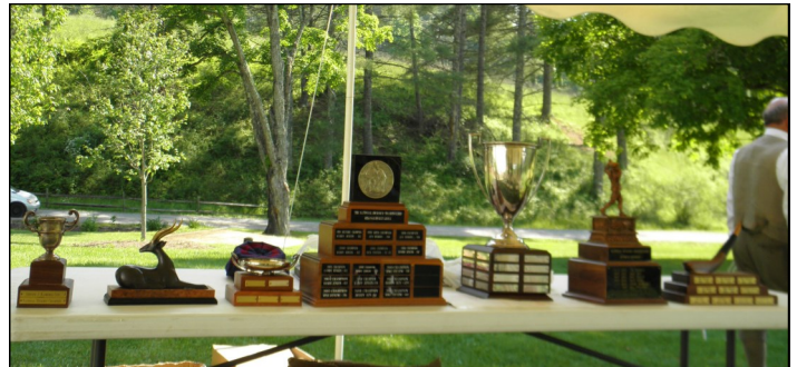
The trophy table ready for the awards presentation