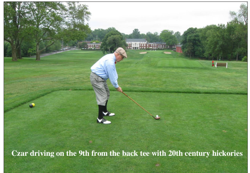
Czar driving on the 9th from the back tee with 20th century hickories